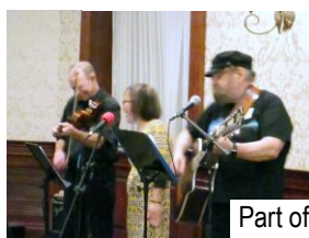
Part of the "Four Flats and a Spare" band

(My Personal Testimony, continued from page 2 )